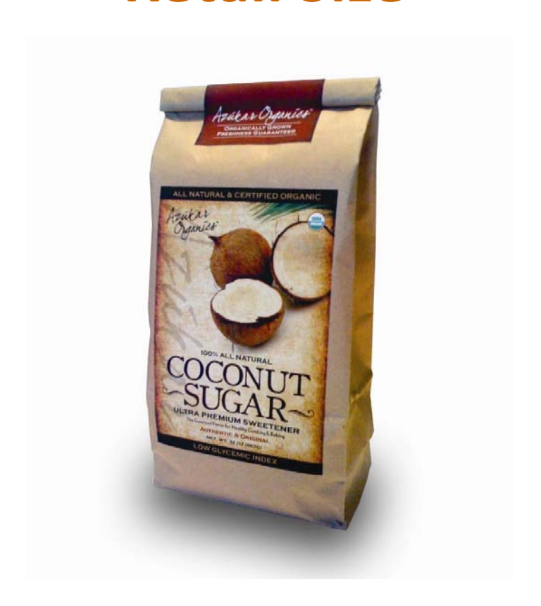
32 & 16 Oz Resealable Biodegradable PLA Lined Kraft Bag