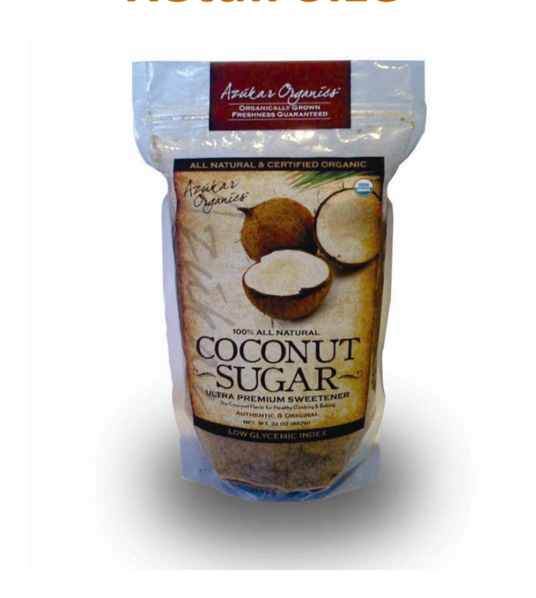
32 & 16 Oz Resealable Plastic Pouch